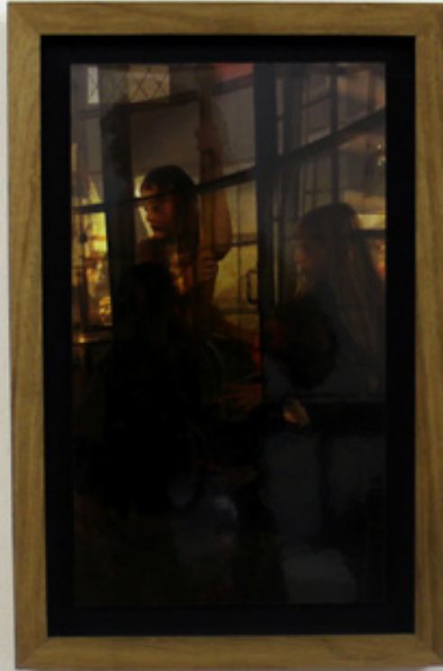
LAETITIA LUPS "Mädchen mit Hornen" 2011 Kunststoff, Holz, Metall 100 x 100 cm Kunststoff, Holz, Metall 100 x 100 cm