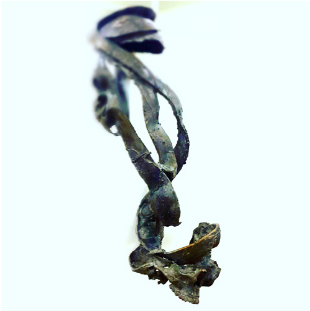
"Leaving the Table" (2017) Bronze (unique) approx. 63 x 30 x 20 cm R 40000