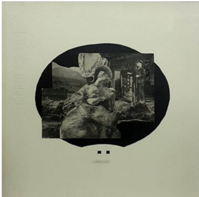
"At the Lake" mixed media collage, 31 x 31 cm R 3350 (framed)