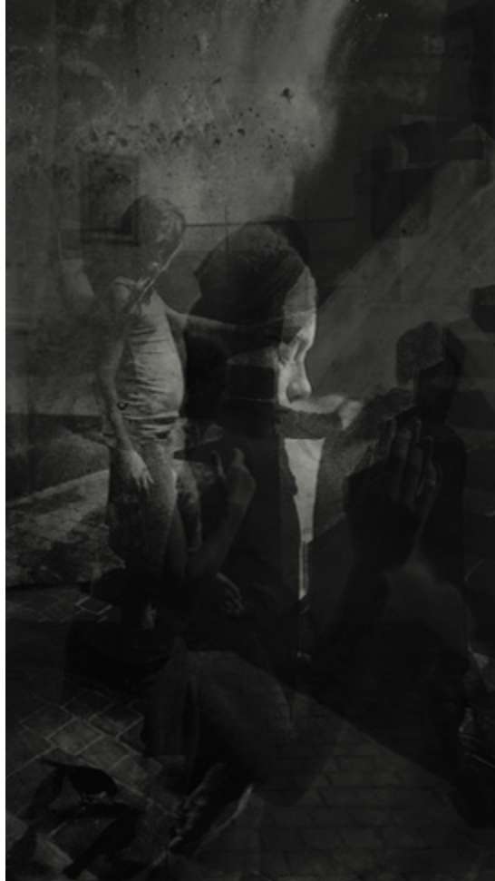
"Bacchae III" Digitally manipulated photographic print on Archival paper and laminated on acrylic board, edition of 3 47 x 31 cm (framed) R 3200