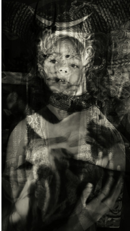
"Bacchae I" Digitally manipulated photographic print on Archival paper and laminated on acrylic board, edition of 3 47 x 31 cm (framed) R 3200