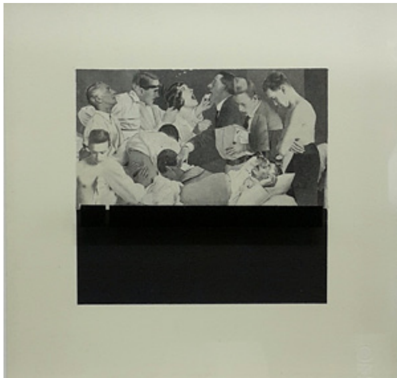
"Swimmer's Ear" mixed media collage, 31 x 31 cm, R 3350 (framed)