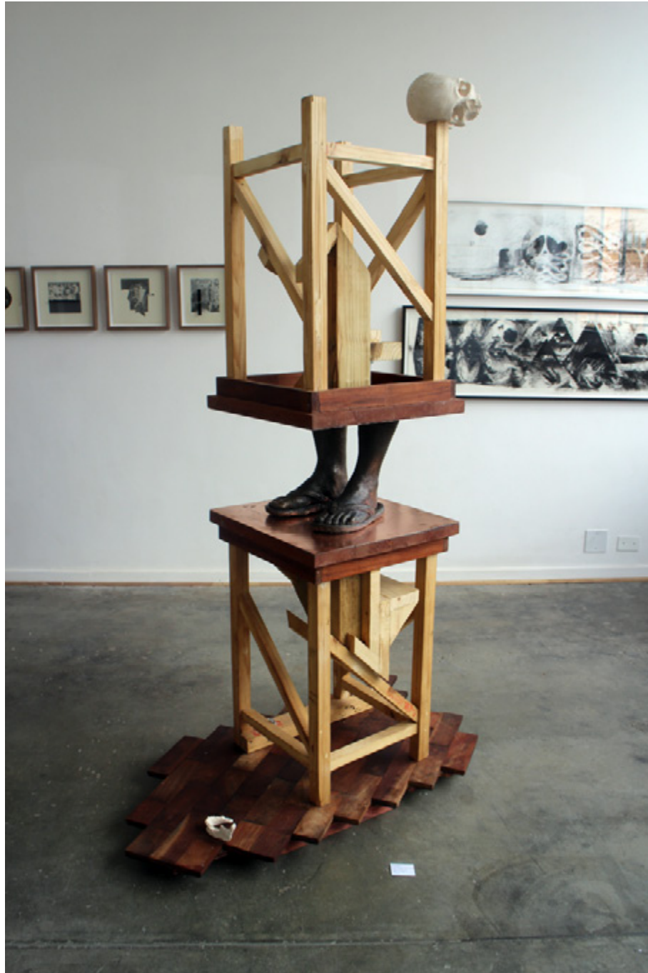
"Eulogy" Found objects and mixed media (sculpture modelling tables, cement, copper) 205 x 53 x 55 cm R 85500