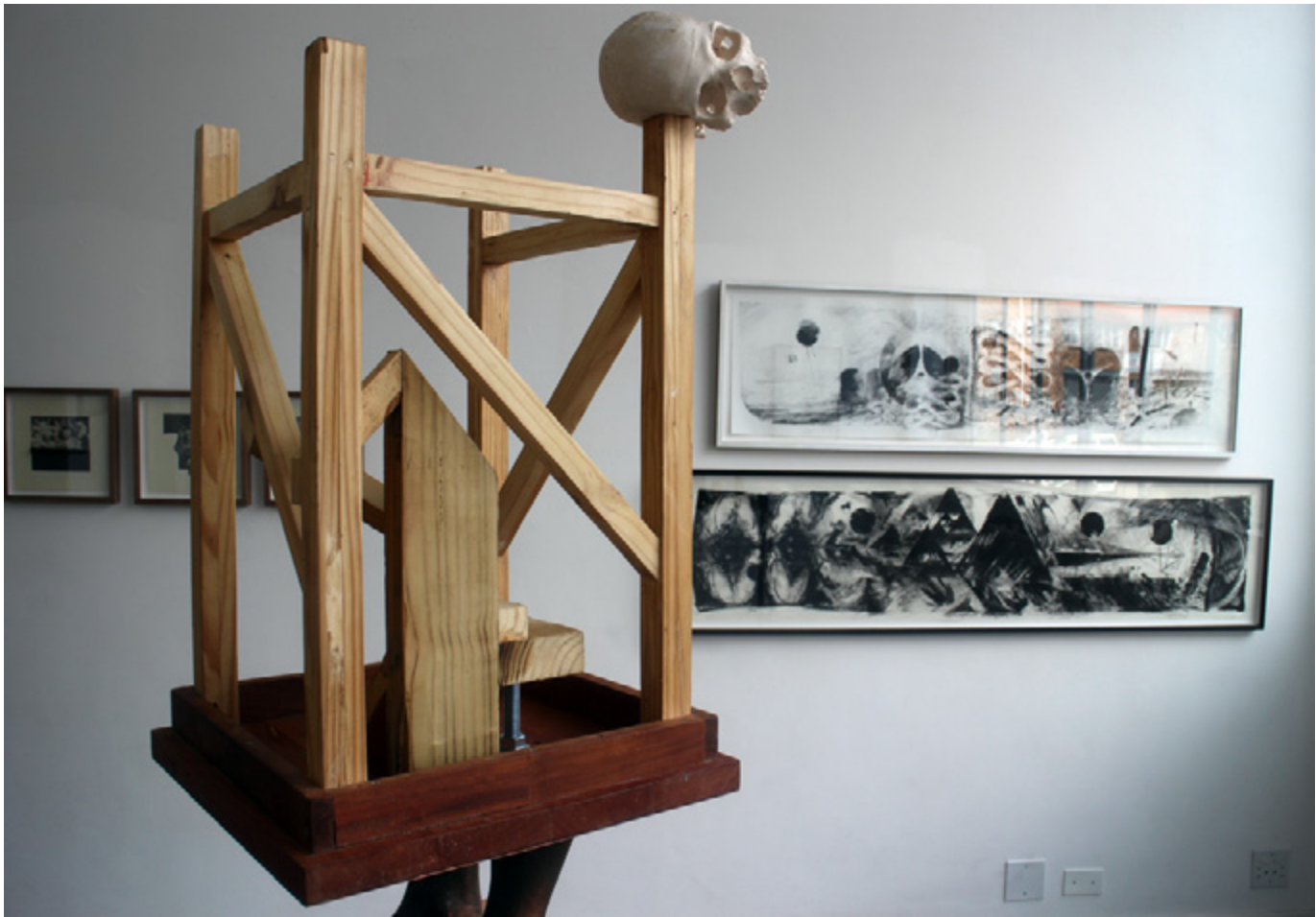
(detail) "Eulogy" Found objects and mixed media (sculpture modelling tables, cement, copper, 205 x 53 x 55 cm R 85500