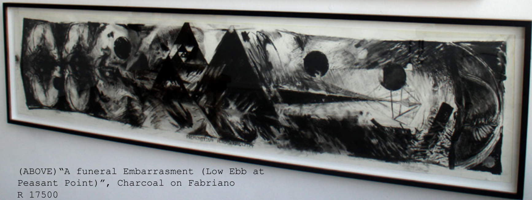
(ABOVE) "A funeral Embarrasment (Low Ebb at Peasant Point)", Charcoal on Fabriano R 17500