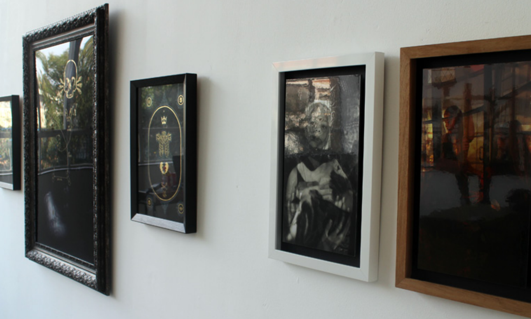
Installation view | Thanatophobia (Part I) | DBS Space | Johannesburg