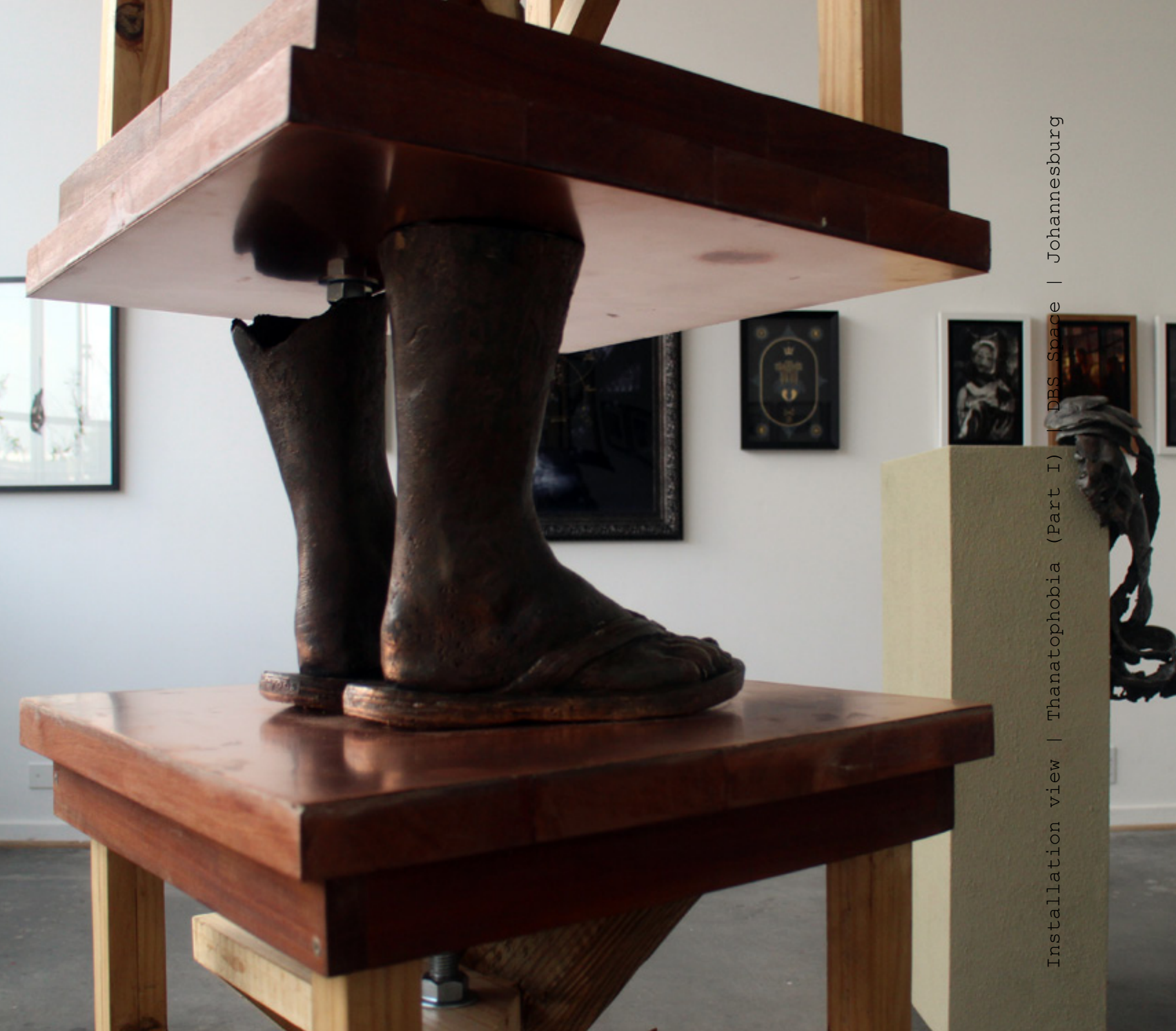
Installation view | Thanatophobia (Part I) | DBS Space | Johannesburg