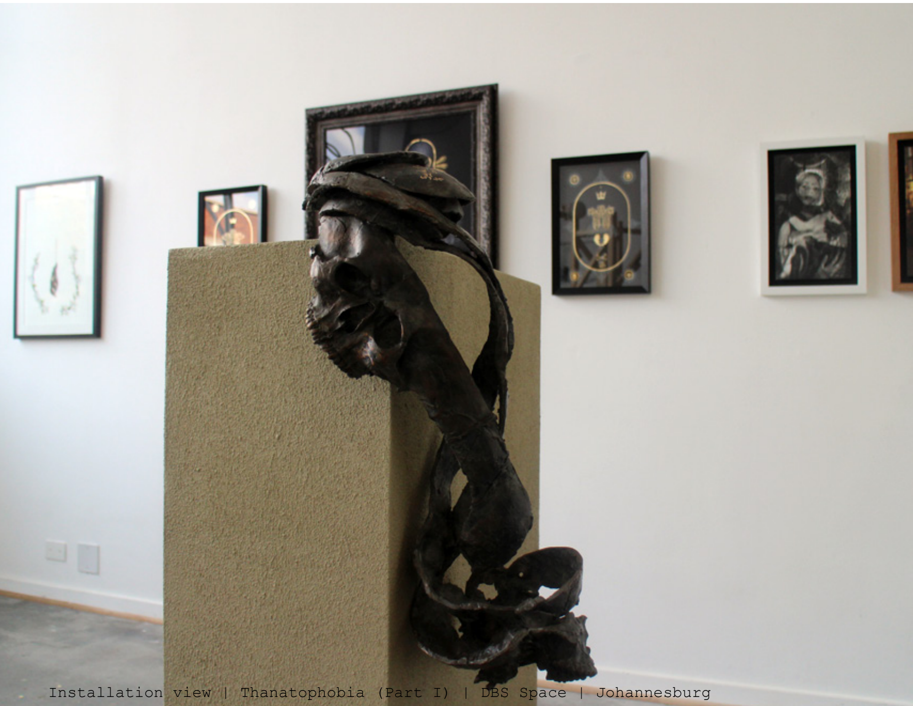
Installation view | Thanatophobia (Part I) | DBS Space | Johannesburg