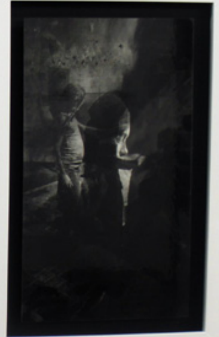
LAETITIA LUPS "Mädchen mit Hornen" 2011 Kunststoff, Holz, Metall 100 x 100 cm Kunststoff, Holz, Metall 100 x 100 cm