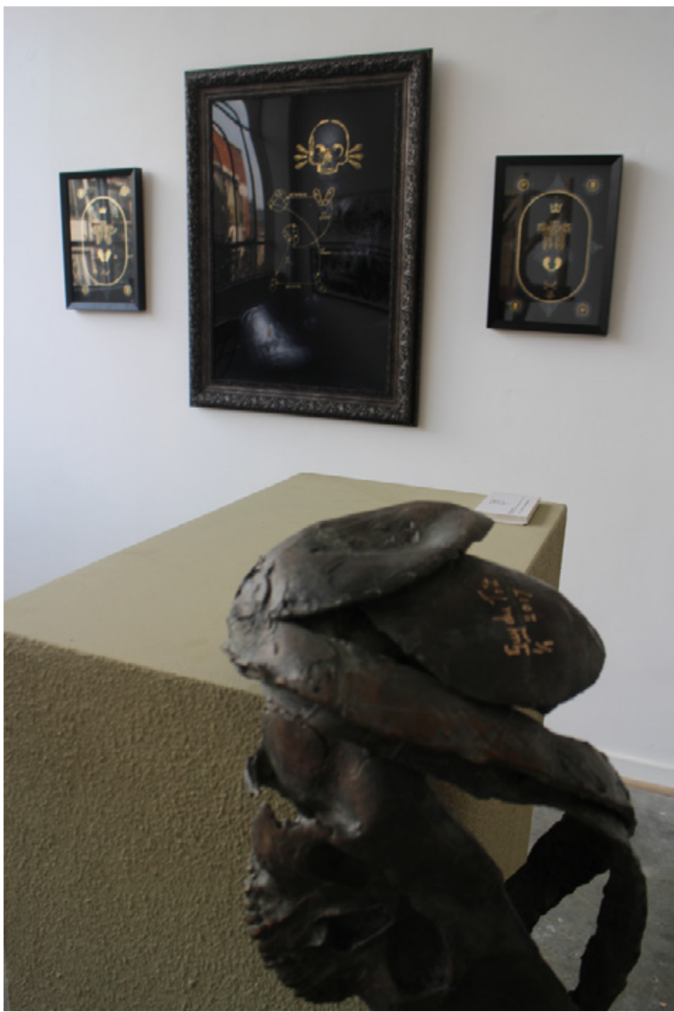
Installation view | Thanatophobia (Part I) | DBS Space | Johannesburg