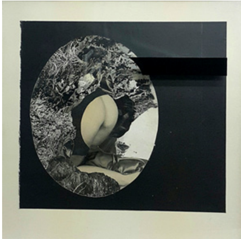
"Seaweed Sequence" mixed media collage, 31 x 31 cm R 3350 (framed)