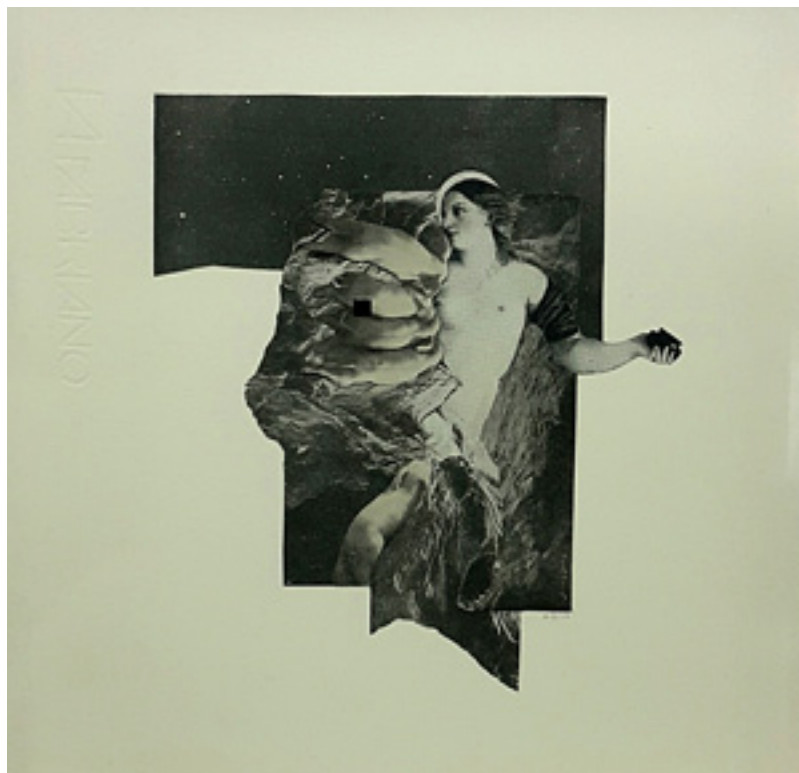
"Oh Deanna" mixed media collage, 31 x 31 cm R 3350 (each)