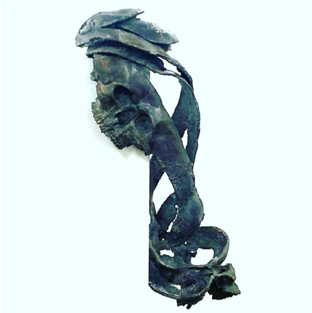
"Leaving the Table" (2017) Bronze (unique) approx. 63 x 30 x 20 cm R 40000