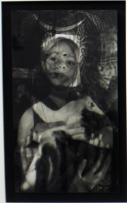
LAETITIA LUPS "Mädchen mit Hornen" 2011 Kunststoff, Holz, Metall 100 x 100 cm Kunststoff, Holz, Metall 100 x 100 cm